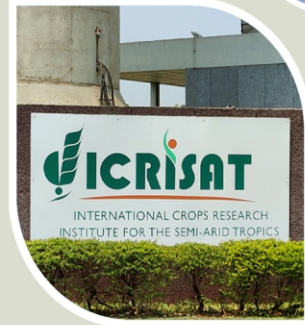
ICRISAT - BHEL