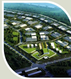
NIMZ - zaheerabad