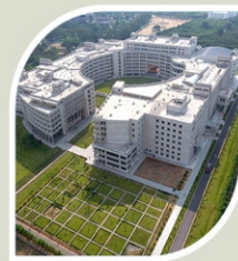
GITAM - HYD